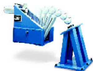
MTS head impact pendulum

A PC control and a manual operating panel are available to operate the positioning system. The PC control allows automatic, semi-automatic and manual positioning.